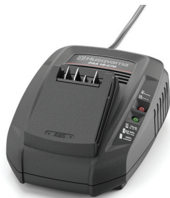
HUSQVARNA ASPIRE™ 18V C70 2.5AH BATTERY CHARGER 970 60 10-03