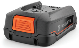
HUSQVARNA ASPIRE™ 18V B45 2.5AH BATTERY 970 60 08-01