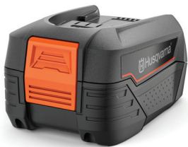
HUSQVARNA ASPIRE™ 18V B72 4.0AH BATTERY 970 60 09-01