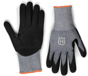
GLOVES, TECHNICAL GRIP 529 88 03-07